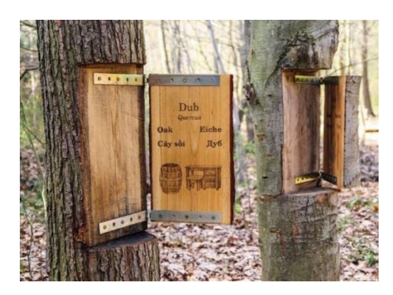
Plan of the installation demonstrating the trunks of the tree species

connected to the biking road leading to the mansion along the river dam. Informative boards and outdoor interactive installations will be set up along the path to raise awareness of the wildlife and values of the wood. The board installed at the junction of the footpath and the road leading from the dam will display the most interesting features of the former forestry practices. The path passes by the open air stage, which has already been operating in summers to stage various local events, thus it can also be incorporated into the