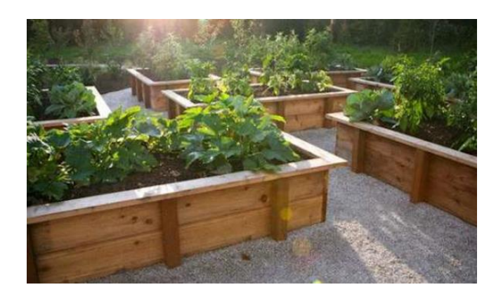
Reference photo of the planned vegetable garden

The area stretching to the east of the building used to function formerly as the kitchen garden of the mansion.