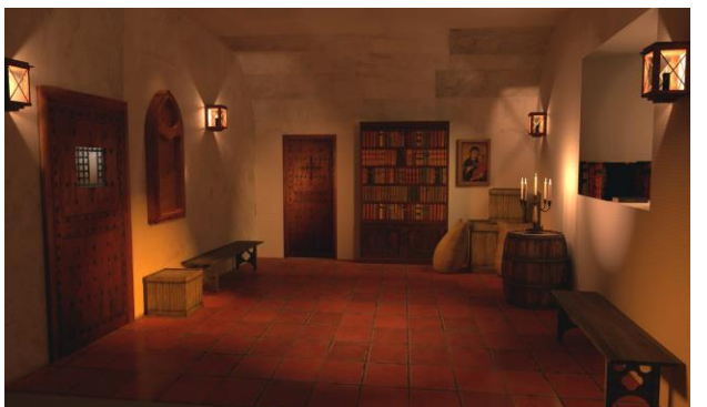
Visual design of the escape room

With a view to strengthening experience based tourism at the site an escape room will be set up inside the building. It will be realized partly in the framework of the Interreg project. The grant gained from the project will