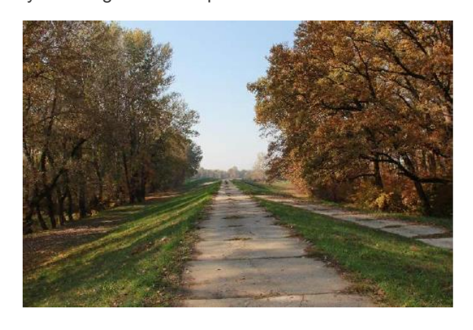
The current state of the pedestrian route to the Bodrog River

By focusing the development of the Borsi Rákóczi Mansion's environment on tourism the goal is to connect