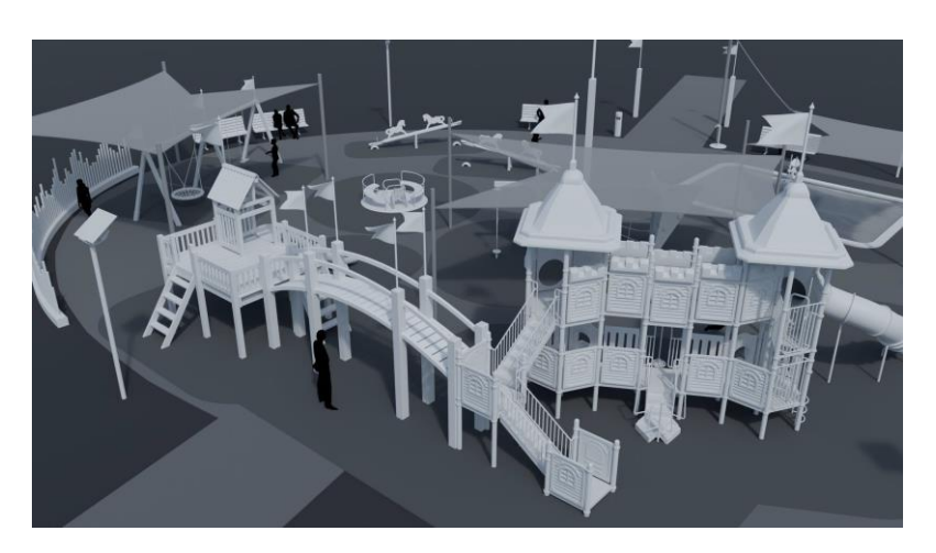
Visual design of the playground

To the south of the planned vegetable garden an area suitable for outdoor events can be found. As part of the exhibition concept a playground, linked to the theme of the exhibition, will be established close to this place, on the edge of the estate wood. The installations of the playground are all developed individually.